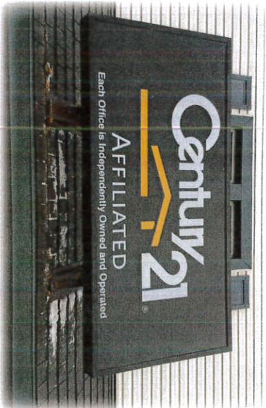
Existing Sign Face in Place

Graphics : Full coverage digitally printed translucent vinyl applied first surface. Print to match customer supplied artwork.