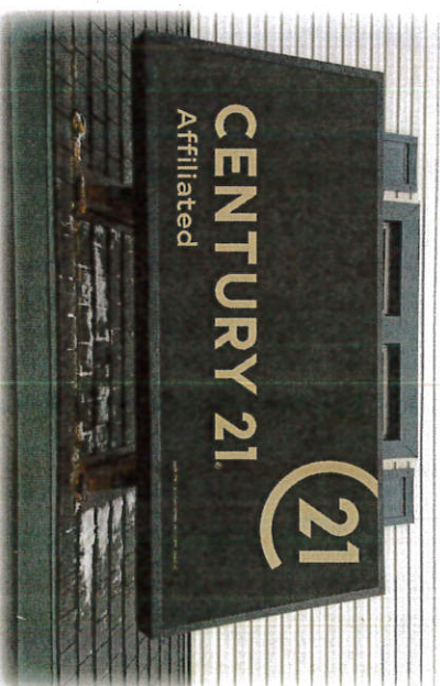
New Sign Face in Place